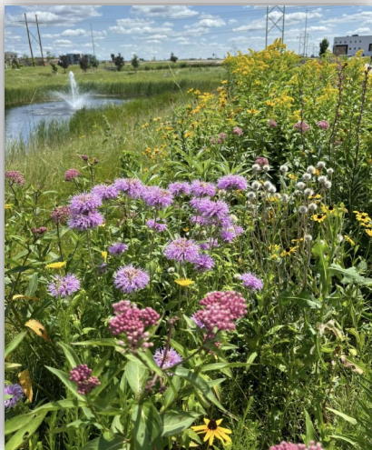
Photo of Urban Plains Park in Fargo, where United Prairie Foundation has planted high diverse Red River Valley sourced Prairie.

A grant from the Enderlin Area Community Endowment Fund in 2023 helped pay for a trip to Medora, where 4-H students collected beetles to battle leafy spurge.