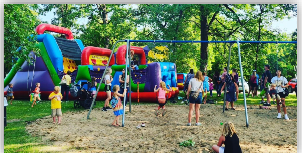
The 2023 Music & Art in the Park event had inflatables, thanks to a grant from the CCF.

Grants are awarded once a year. Any organization with a 501(c)(3) status, governmental agency, or group that has a fiscal sponsor can apply. More information and the online application can be found at www.NDCF.net/Cavalier .