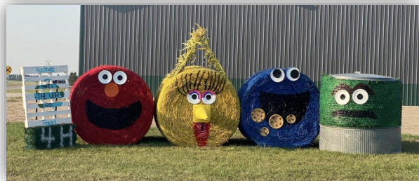
The decorated haybales this fall were amazing and brightened up our town! Thanks to everyone who participated!

If you are interested in applying for a grant, applications are available online at www.NDCF.net/Maddock . Grants are awarded once a year and the deadline is March 31. ♦