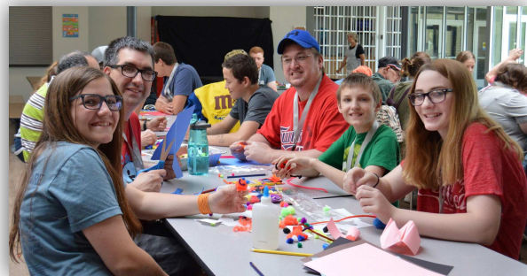
A grant from the Richardton Area Community Foundation helped purchase art supplies for Camp ReCreation's 2019 camp

Grants are awarded once a year. Any organization with a 501(c)(3) status or government agency may apply. Applications are available online at www.NDCF.net/Richardton .