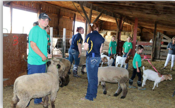
Area youth house livestock in the C.M. Cook Youth Development 4-H and FFA Club Barn as they learn about feeding, caring for, and showing their animal. Photo by Jenny Schlect/Agweek, July 2, 2019