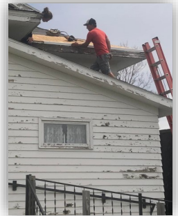
Mouse River Park Chapel

Grants are usually awarded once a year. Any organization with a 501(c)(3) status or government agency may apply. Applications are available online at www.NDCF.net/SherwoodAntler .