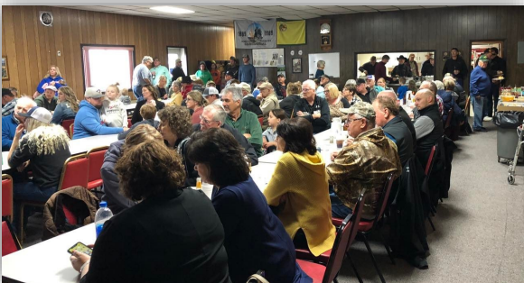
There was a great turnout at the Antler Outlaws "Look Who Survived the Winter" potluck in April—the freewill offering brought in over $4,000 to our fund! Thanks!