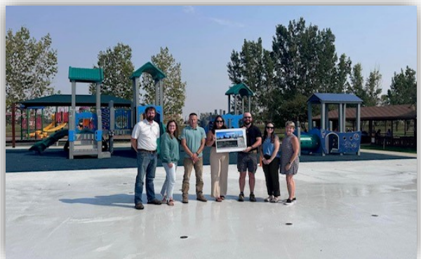
The Bowman & Slope Community Foundation awarded a grant that helped make the Bowman Splash Pad a reality this past summer.