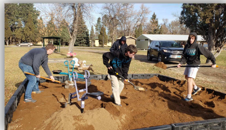
Hebron High School students helped with final work on the new playground equipment in November.