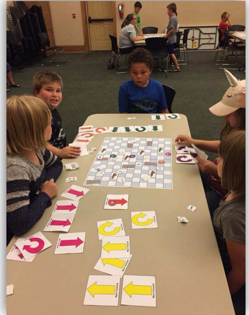
Children participate in a coding activity as a part of the STEAM activities at the Dickinson Public Library.

Grant applications for the 2019 grant round will be accepted from April 1 through May 15 of 2019. For more information, go to www.NDCF.net/Dickinson . ◇