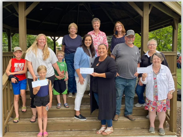
Enderlin Area Community Endowment Fund committee members and 2023 grant recipients at the grant awards in June of 2023.