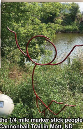
Check out the 1/4 mile marker stick people on the Cannonball Trail in Mott, ND