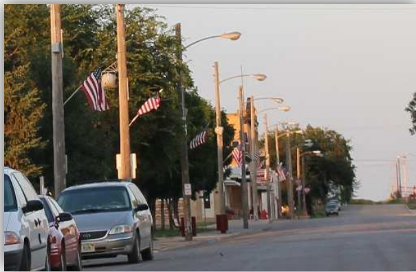
The New Salem Area Community Foundation has awarded several grants to the American Legion Post #91 to assist with their American flags project and also awarded a grant to the Fire District for new turn-out gear.