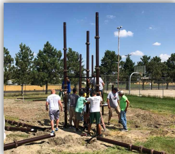
New playground equipment was installed at Prairie View Elementary last year, thanks to a grant from the foundation.

Grants are awarded once a year. Any organization with a 501(c)(3) status or government agency may apply. Applications are available online at www.NDCF.net/NewSalem and due by March 15. ♦