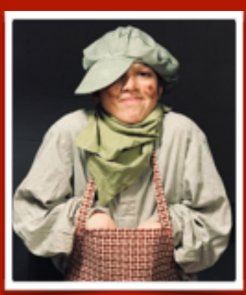
w Kline in last year's MCT play