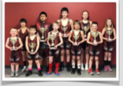
lexander wrestlers who placed at th State Tournament in March 2019

SPECIAL NORTH DAKOTA TAX CREDIT! - If you give at least $5,000 to the APSF Endowment Fund, you may