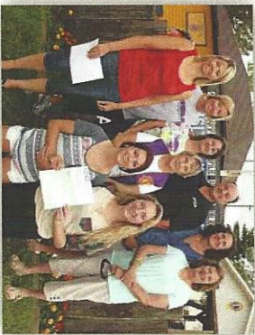
Photo above: New England Area Community Foundation Advisory Committee members and 2014 grant recipients.

2013: $5300 2014: $5900 2015: $5920 2016: $5000 $22,120