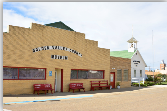
The Golden Valley County Historical Museum received a grant of $2,664 in 2018 to make repairs to its building.

There is over $3,400 available in grant money this year. Grant applications and more information is available at www.NDCF.net/GoldenValleyCounty