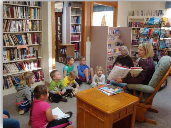
Story hour at the New England Public library. A 2018 grant will be used to purchase new shelving for the library.

*Includes data from the Ishmael & Rose Diede Charitable Fund for New England