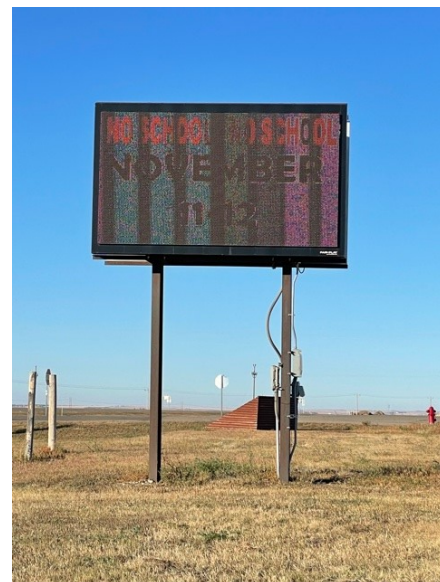
Community event sign purchased years ago with the help of foundation funds

A reminder that the community event sign, purchased with the help of Foundation funds, is available for advertising community events as they arise. The fabulous staff at the school try to keep up with the posting of these events, but would appreciate the community's help in making sure not to miss anything!