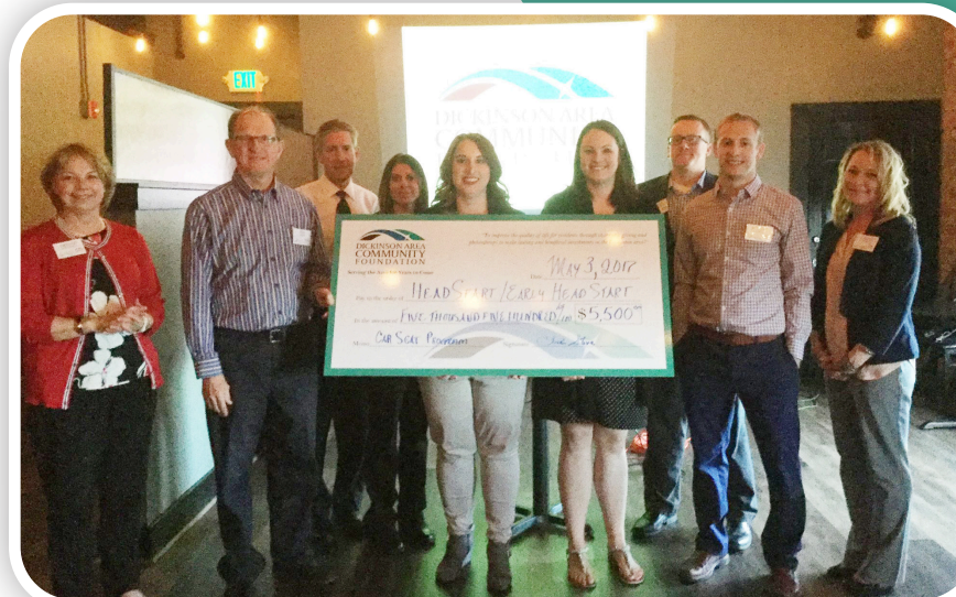
Members of the DACF committee present a check to the Community Action Partnership to help purchase car seats for the Dickinson community.

The Dickinson Area Community Foundation (DACF) is a component fund under the umbrella of the North Dakota Community Foundation (NDCF). Established in 1976, NDCF manages over 650 charitable funds and over $80 million for the betterment of North Dakota citizens and their communities. NDCF provides comprehensive charitable services including donor gift planning, bequest planning, and fiduciary services such as accounting, audit, and money management.