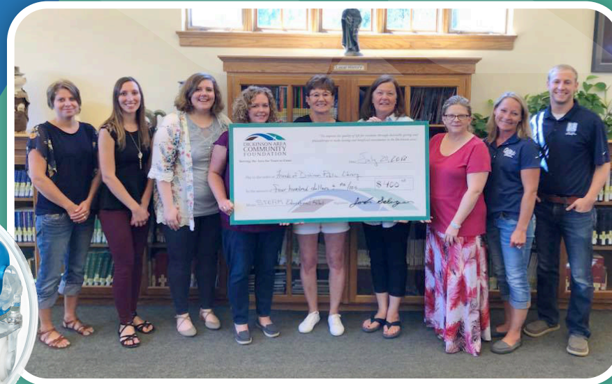
Members of the DACF committee present a check to the Friends of the Dickinson Public Library to purchase a Sphero SPRK STEAM Educational Robot (pictured left).