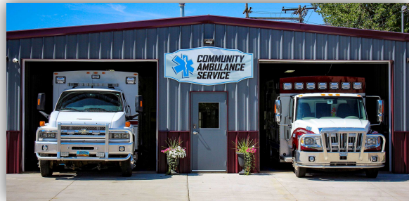
Community Ambulance Service, Inc. has received two grants from our community foundation in the past to upgrade equipment.

The fund has awarded $20,438 in 14 different grants since 2011 to various organizations and entities in our area. Other grantees have included Lincoln Elementary School, the Golden Valley Historical Museum, the Golden Valley County Fair Association, and Community Ambulance Service, Inc.