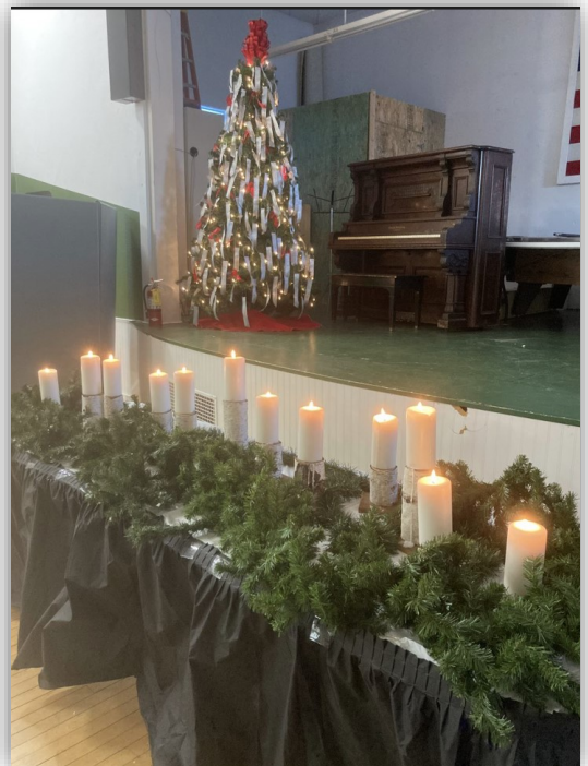
DACF hosted the 2022 Tree of Lights celebration last December. Thanks to all who attended!