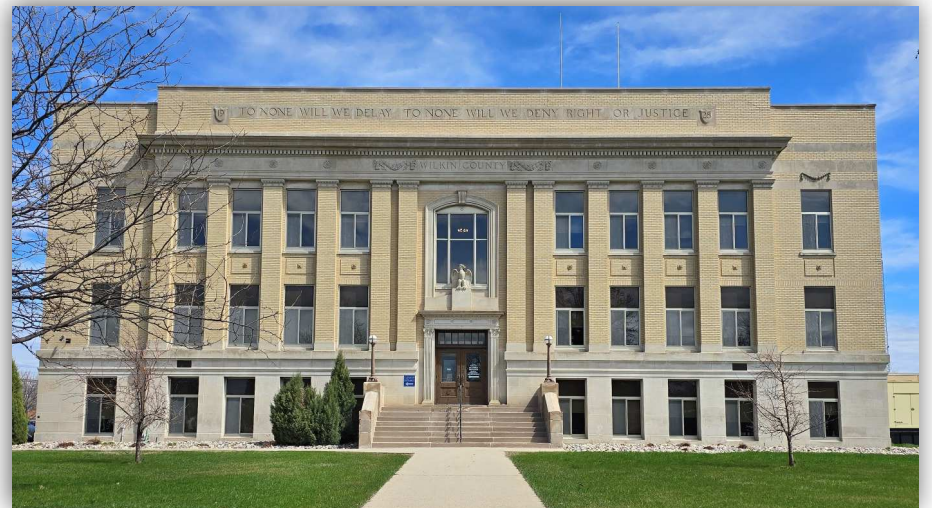
Richland County and Wilkin County Courthouses