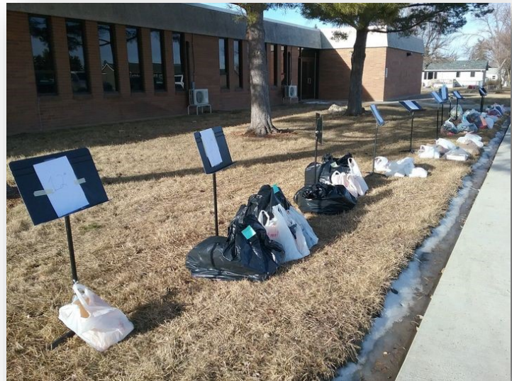
Books, supplies and meals await bus delivery to students' homes

Many readers shared on Grenora Gophers Facebook delight and support of their alma mater and of school staff in their efforts to cope with this mysterious virus. At the writing of this newsletter a new school year has resumed and staff remains committed to continued safety for their students and everyone. Thanks folks!