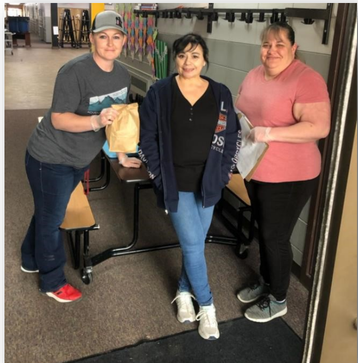
Kitchen staff cooked and bagged meals for students at home