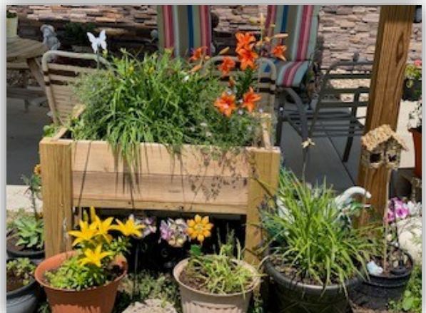
GUPPIES (Glen Ullin People Promoting Interest & Events) built six plant boxes with their grant. The boxes were placed around town, with several at Marion Manor.

* Includes data from the Ishmael & Rose Diede Charitable Fund for Glen Ullin, ND