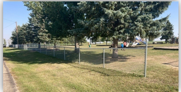
The new playground fence at the Anamoose-Drake Elementary School was partially funded by a grant by the Anamoose Area Community Foundation.

Grants are awarded once a year. Any organization with a 501(c)(3) status or government agency may apply. Applications are available online at www.NDCF.net/Anamoose .