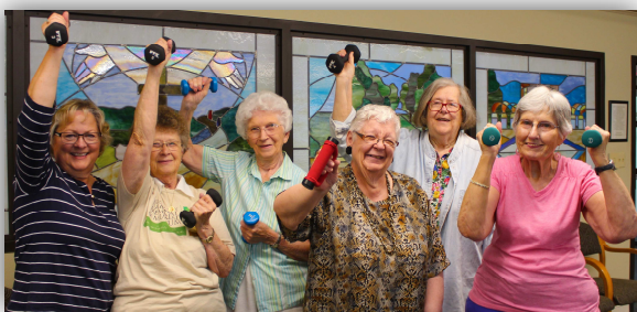
The Community of Care for Cass County, ND has received numerous grants from their local community foundation to provide services to enhance the quality of life for older adults, including exercise classes to keep people in their homes as long as safely possible.

These projects are examples of what can be accomplished through local charitable giving. Large and small gifts to these community foundations were combined together to make those grants possible. When considering ways to support economic growth and community vitality, remember that philanthropy is a critical piece of the puzzle. ◇