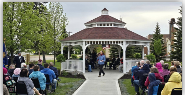
The new gazebo near the Larimore Museum was partially funded with a 2023 grant from the LCEF.