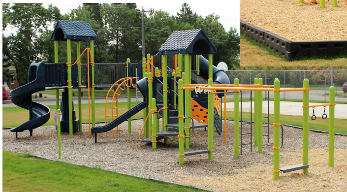
The second playground (above), completed this year, complements the playground installed in 2013 (left). Donated funds made both possible.