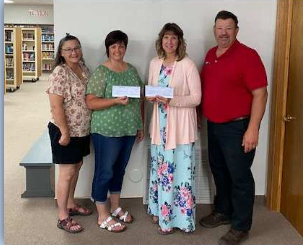
2022 grantee check presentation.

Grant applications are accepted from June 1 - June 30 every year. Application forms and information about the process are available online at www.NDCF.net/GoldenValleyCounty . The Golden Valley County Advisory Committee will discuss applications and recommend grant awards.