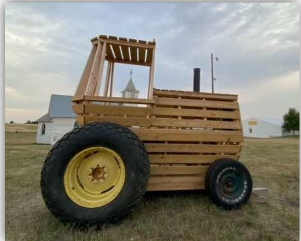
The Hazelton-Moffit-Braddock's first grant helped fund this new piece of playground equipment at the Threshing Grounds north of Braddock.

Grant applications are accepted once a year and are due by May 31. Go to www.NDCF.net/HMB for more info. ◇