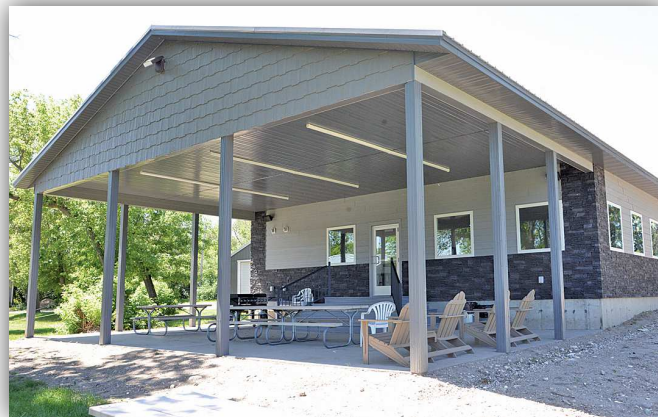
A grant from the foundation helped fund the Prairie Rose Golf Course Clubhouse project.