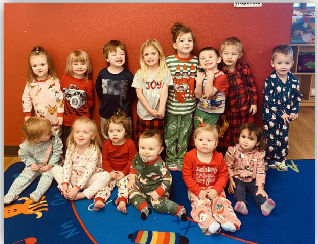
A 2022 grant from the Powers Lake Community Foundation bought new magnets and blocks for the kids at Lil Ranchers CCC.

Grants are awarded from the fund once a year. Any organization with a 501(c)(3) status or government agency may apply. Applications are available online at www.NDCF.net/PowersLake .