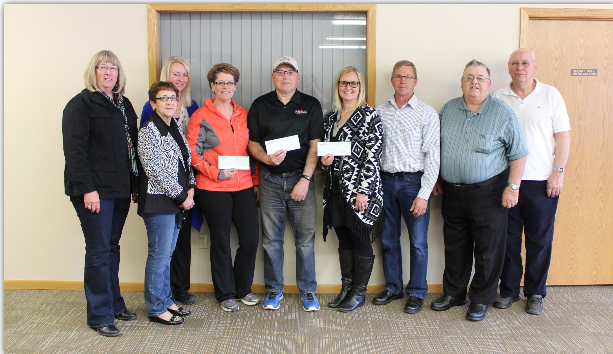
2015 Grantees receive their grant awards from New Salem Area Community Foundation Advisory Committee members.