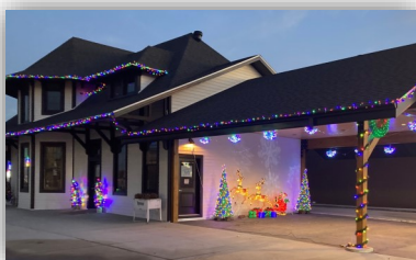
Left: A 2022 grant from the HACF helped purchase Christmas décor and picnic tables for the new Depot patio.